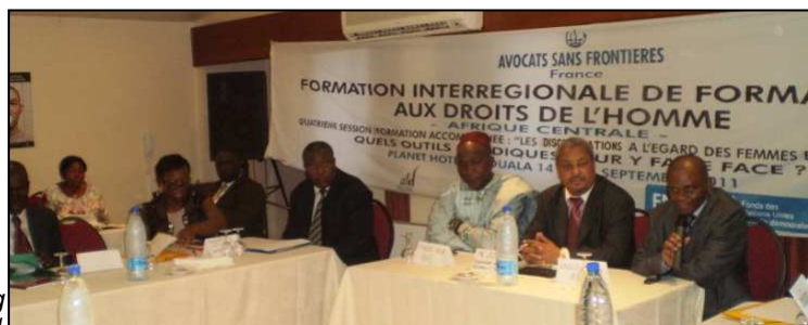
The participants of the training Douala - 2011

A new project has been developed to take over and reinforce the gains made. It will concern the efficacy of the African system of human rights protection, bringing together the defenders trained in the program.