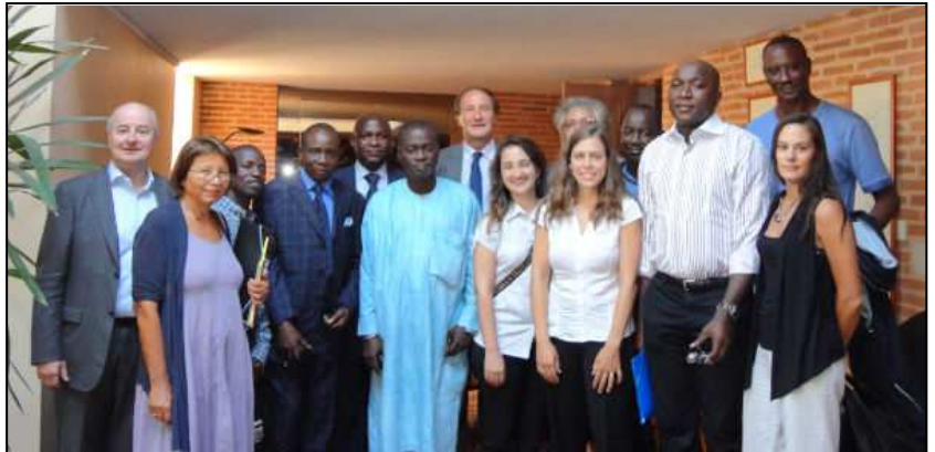
Opposite: The representatives of ASF being received by the President of the Toulouse Bar

11 Avocats Sans Frontières associations from around the world (ASF Brazil, ASF Cameroon, ASF Congo, ASF France, ASF Guinea, ASF Mali, ASF Mauritania, ASF Democratic Republic of the Congo, ASF Senegal, ASF Sweden, and ASF Switzerland) came together at the end of October for a session of internal reporting and reinforcement of questions of common interest: organization of community life, set-up and execution of projects, coordination of missions in the field, etc.